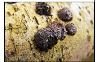
Close-up birch wood wart

Into the woods beside Spring Lane to find some fungi and perhaps a few insects? Yes— a common earwig on a twig, followed by this inoffensive garden cross spider, both well-spotted in murky undergrowth. But not many fungi. The view round the south-west bend gave us