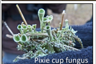
Pixie cup fungus