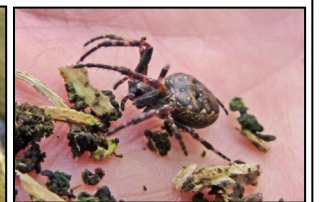
Garden cross spider