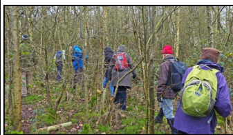
Into the woods ....

Into the woods beside Spring Lane to find some fungi and perhaps a few insects? Yes— a common earwig on a twig, followed by this inoffensive garden cross spider, both well-spotted in murky undergrowth. But not many fungi. The view round the south-west bend gave us