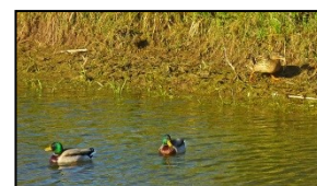
Two mallard families

deeper pond, two swans, a little grebe, a coot (by the nest island), two geese and two moorhens. Two blue tits along the rising path east were followed by a pied wagtail, two pairs of skylarks, four linnets, a kestrel, magpie and (near the solar panels) song thrush, meadow pipit, white throat and willow warbler. As we returned to the car park, three feral pigeons and a mallard completed our score for the day—total of forty one species.